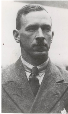
Figure 9 Percy R Stephensen