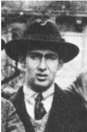
Figure 8 Robert Lowe Hall