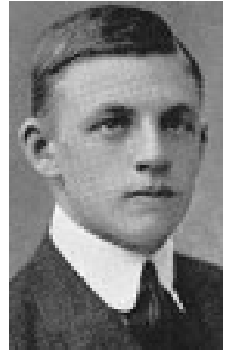
A W L Row