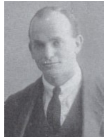
Figure 4 Fred Paterson